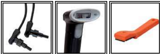
Universal connectors 90°