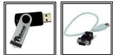
Software Ritmo Transfer